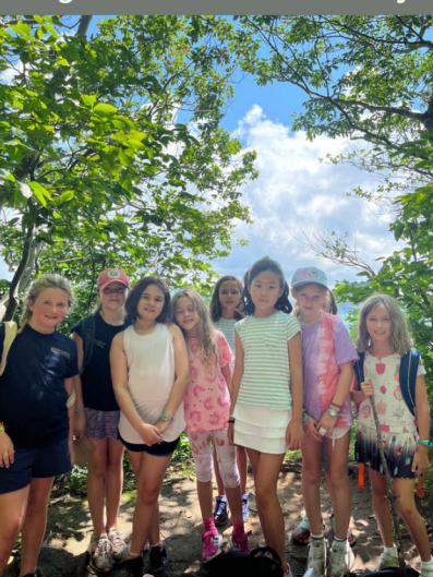
Eagle's Bluff on Lake Morey

Camp Lochearn is proud to call Vermont home! The changing leaves of Vermont are gorgeous in late September, but many experienced foliage viewers consider late October to be the most beautiful time in the Green Mountain State.